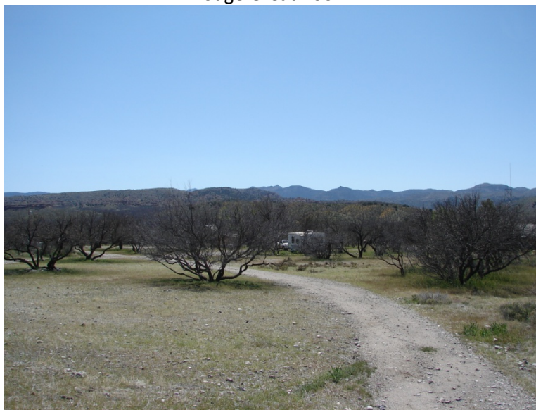
Southwest Portion of Property