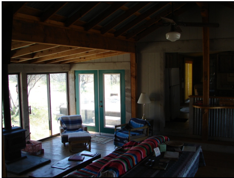
Lodge Great Room

7254 E. Southern Ave. Suite 107, Mesa, Arizona 85209 (480) 539-2671 Phone, (480) 507-4731 Fax, (480) 695-4506 Cell