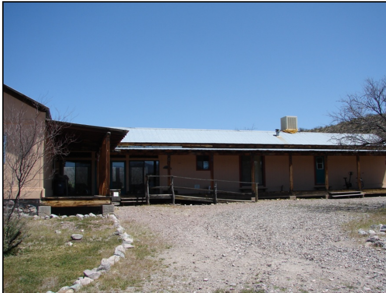
Horse Head Lodge

We believe the information contained herein to be correct. It is obtained from sources, which we regard as reliable. While we do not doubt the accuracy of this information, we make no guarantee, warranty, or representation about it. It is your responsibility to independently confirm its accuracy and completeness. You and your advisors should conduct a careful, independent investigation of the property to determine to your satisfaction of the suitability of the property for your needs.